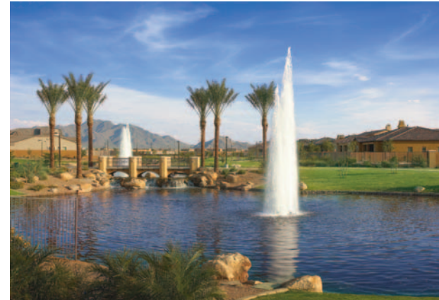
Valencia offers luxury living in a beautiful park-like setting with views of the San Tan Mountains to the south.

bathroom, a fireplace in the family room, companion paint package, 10-foot ceilings with graceful archways, 8-foot entry doors, plus T.W. Lewis' signature wood window sills.