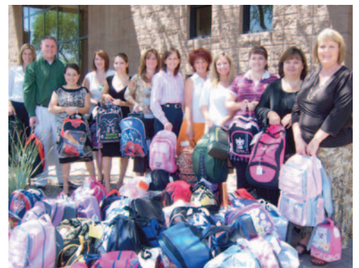
In August 2007, T.W. Lewis associates provided backpacks and school supplies in support of 75 children at Aid for Adoption of Special Kids.

of children with special needs into permanent, loving homes. For more information on AASK, please visit www.aask-az.org . 🏠