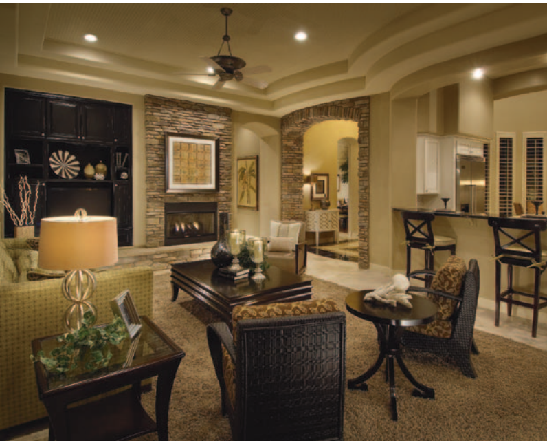
T.W. Lewis models at Blackstone exude all the luxury, glamour and sophistication one would expect at the Valley's premier country club community.

T.W. Lewis is among a small group of elite builders offering homes at the exclusive Blackstone community, which will include 500 homes within 590 acres at completion. As the only