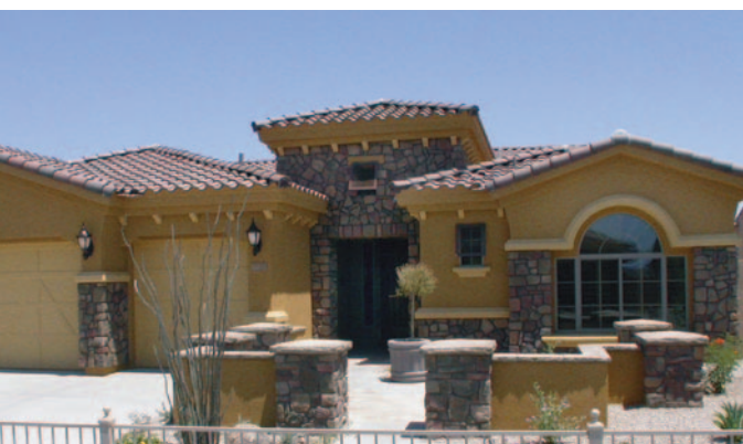
Key elements of the Tuscan style—rich color and stone—are shown on the Lamara model.

10-foot volume ceilings, custom designed light fixtures and numerous display niches are just a few of the distinctive details that