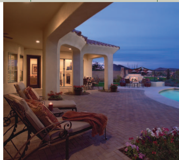
Montecina offers access to Vistancia's myriad of amenities in a spectacular natural desert setting.

homes at Montecina are architecturally stunning. For the ultimate in desert living, basements are offered on five plans, with options for casitas, a snail shower in the master bath, fireplaces in the family room and/or outdoor courtyards, plus additional bathrooms and up to six bedrooms. With a typical lot size of 80 by 135 feet, Montecina is the choice for homebuyers who wish to enjoy luxury living in the West Valley's award-winning Vistancia community. Pre-sales for