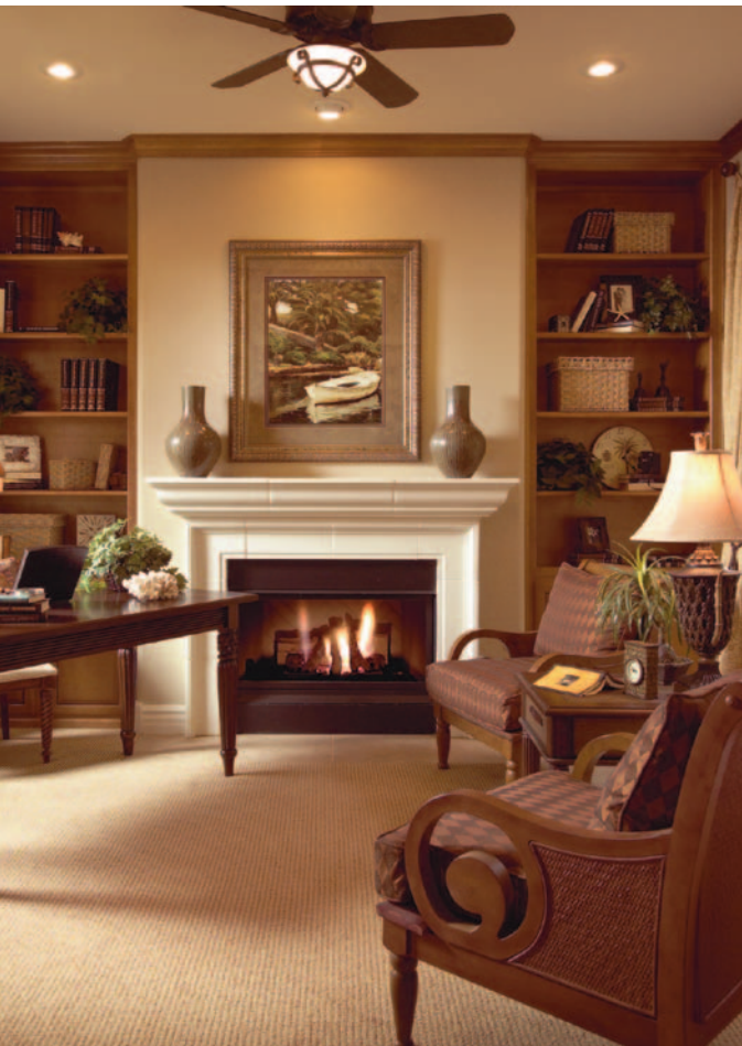
Homes at The Willows offer quality construction and luxury touches that have become T.W. Lewis' signature.

Located across an arroyo and directly adjacent to Desert Springs, Desert Trails is a gated, all single-story neighborhood surrounded by desert trails. All this, combined with the amenities offered within the Sonoran Foothills masterplan, make Desert Trails a highly-desirable neighborhood. Sixty-six homes will be offered in Desert Trails, with a typical lot size of 10,800 square feet. For more information and driving directions, please check twlewis.com or call 623-466-8462. 🏠